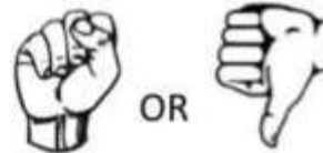
Signal for 'Dead'