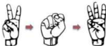
Two Dead, Three Points