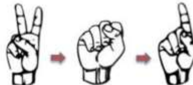
Two Dead, One Point