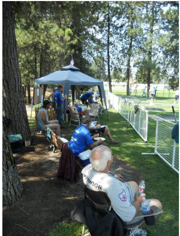
Enjoying shade in Winton Park