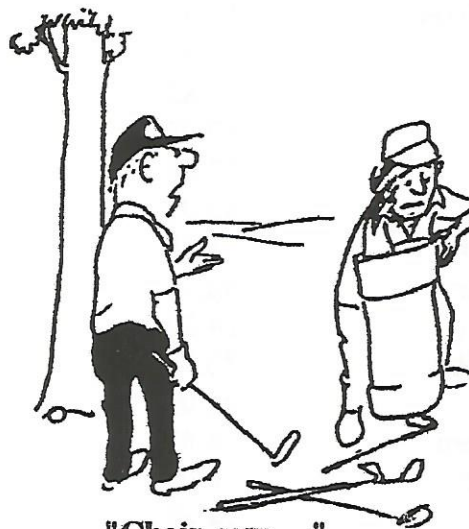
"Chain saw . . ."